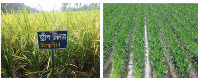
Fig. 2. Effect of tillage on rice growth

practices (CT) at all three locations. The crop grown in strip and raised bed system received more light, air and was also benefited by border effect which resulted in better growth and yield. In the strip till system, plants grow in line and it is easy to perform intercultural operations. As the soil is